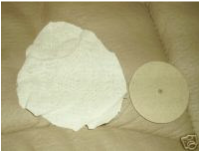
Photo 7 Cardboard circle from figure and cloth circle