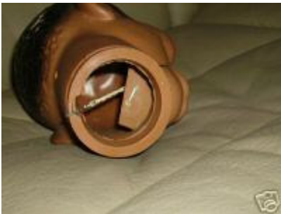
Photo 2 Hook attachment on rim of neck (at back of head)

Band replacement Once the head is off, the band can be replaced. Different figures had different ways the rubber band was placed to make the mouth close. If you are lucky, parts of the band are still in place and you can readily see the attachment points. One will be on the back of the jaw. The other will be at some attachment point on the head. It may be a hook that attaches to the rim of the neck (at the back of the head) as in photo 2 .